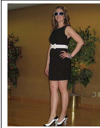
Fashionable and Oh Soo Cute!