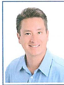
Each Office is Independently Owned And Operated.